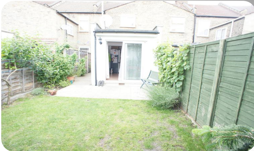
Thorpe Road, East Ham, E6